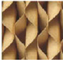
7090 tipi Greenpad

The Greenpad which is the most basic part of evaporative cooling is kept wet continuously by providing water circulation. Hot and dry air pass through the wet pad with a fan. Heat transfer becomes between air and water during this transition. Cool and humid air is given where it is wanted to be cooled.