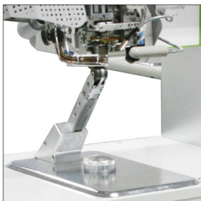
Option : 24mm Roller Arm (for Shoes)