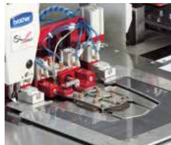
Retractable inner clamp