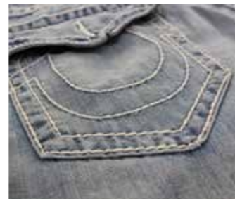
Thick thread fashion style