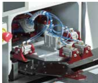
Folding group with open software